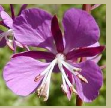
➤ Flowers: petals 4