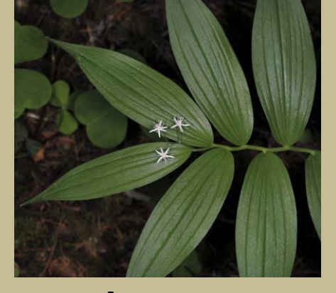
Leaves Parallel veins